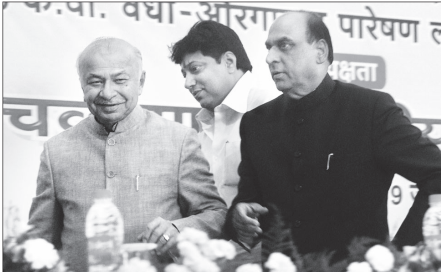
POWER-PACKED MEET: Union power minister Sushilkumar Shinde (left), MP Dutta Meghe (right) and Ranjit Kamble during the foundation stone laying down of 1,200 KV Deoli-Aurangabad power line in Wardha on Sunday. This is the maximum voltage line in the world